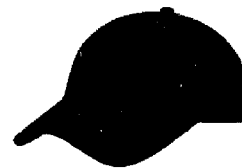
C608 - Structured ball cap