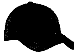
C830 - Unstructured