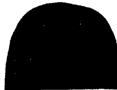
CP91 - skull cap