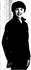
995M - 1/4 zip pullover