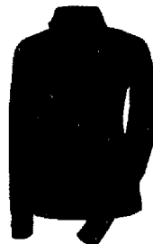
LST850 - Ladies 1/4 zip drift